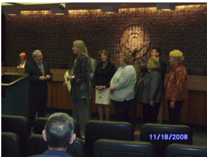
Amarillo City Council Proclamation

The month of November was busy for Epilepsy Foundation West Texas. The name change brought recognition to the organization for all the services it brings to our coverage area. The Amarillo, Lubbock and Midland City Councils recognized EFWT name change and proclaimed November Epilepsy Awareness Month.