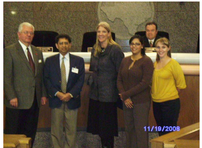
Lubbock City Council Proclamation